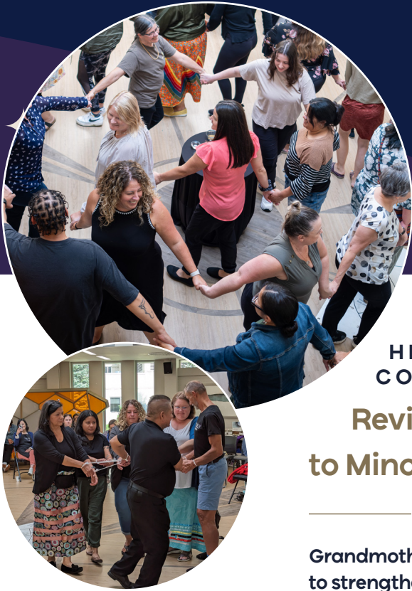
Diocese of Hamilton