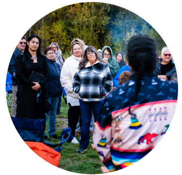
Archdiocese of Edmonton

Friendship Centres in Alberta support over 220,000 Indigenous individuals annually, providing culturally appropriate programs and services. Governed and led by Indigenous voices, ANFCA and its member Friendship Centres create safe, welcoming spaces for community development, empowering Indigenous people to fully engage in and contribute to their communities.