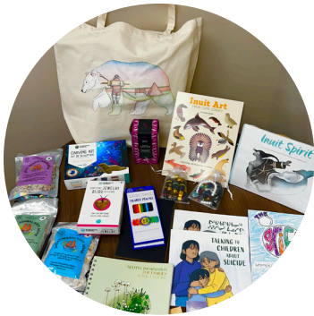
Diocese of Churchill-Hudson Bay